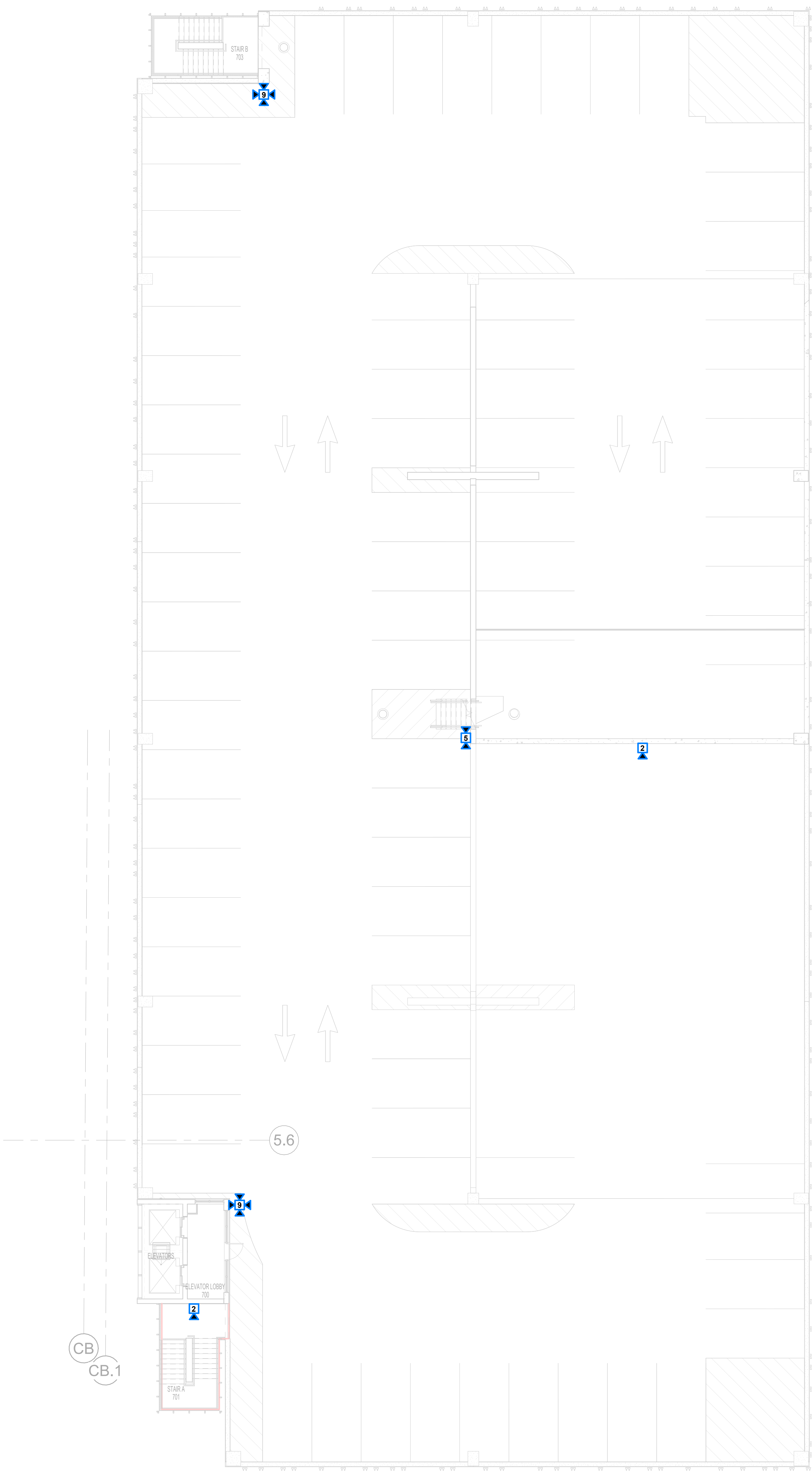
1 SECURITY FLOOR PLAN - LEVEL 7 (ROOF) - PARKING GARAGE 3/32" = 1'-0"